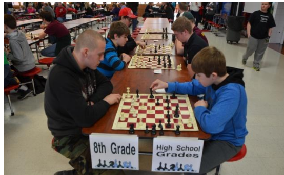
A hard fought struggle develops!