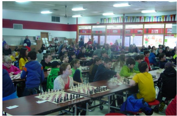
The 95 contestants ready themselves for play!