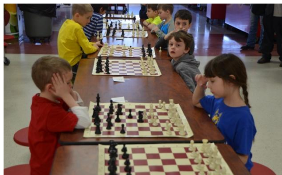
A match of wits ensues!