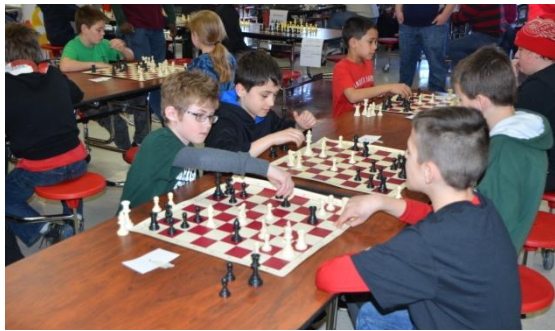
A battle to the very end!