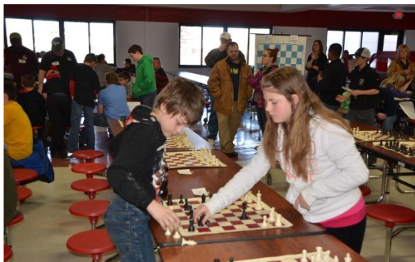
In chess, gender becomes irrelevant!

The following pictures are courtesy of PHCC member Jay Carey.