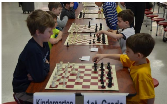
The younger, the better!