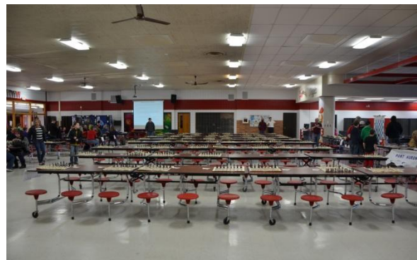
Let the party begin!