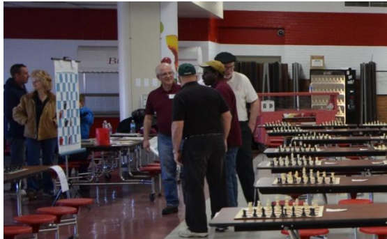
A concentration of PHCC's Finest Judges!