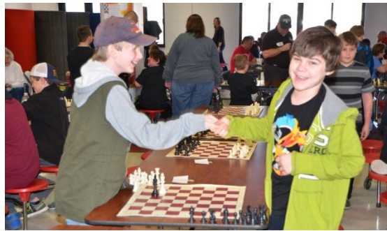
Looks like a draw to me!