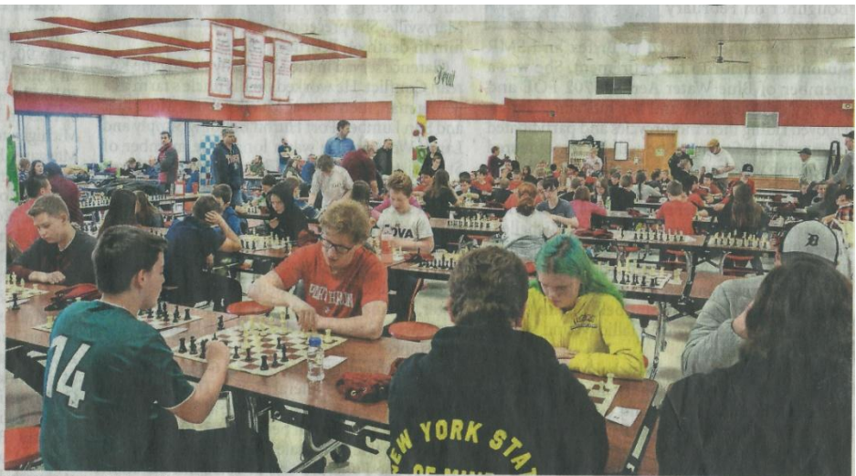
Students filled the cafeteria at Port Huron High School for the annual Phil Willard Memorial Chess Tournament on Saturday.

"There are so many beneficial things that chess has that other sports don't