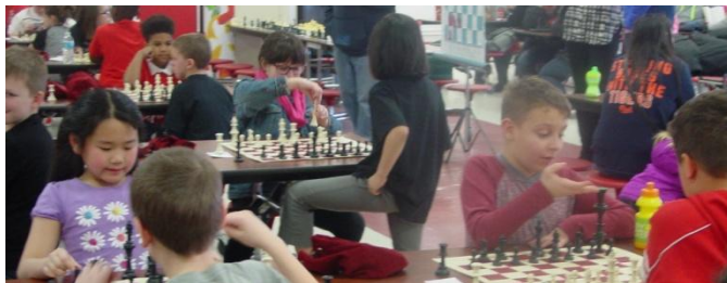
Youngsters demonstrate some very vertically creative combinations!