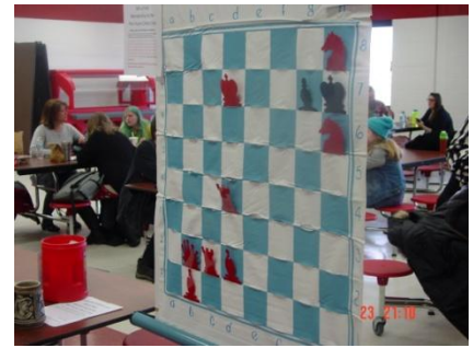
A very tough problem - goes unsolved!