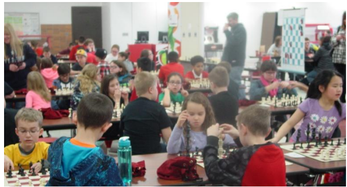
Chess pieces can also be transformed into marvelous feats of engineering !