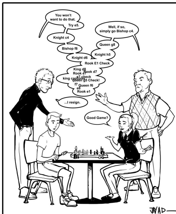
"Advice from Kibitzers - a learners nightmare."