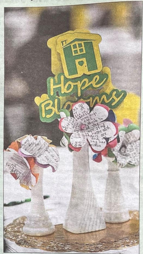
Hunter Hospitality House will host its annual Hope Blooms Fundraiser on April 30.

Hospitality House is a home that “anyone may need, at any time,” according to the organization.